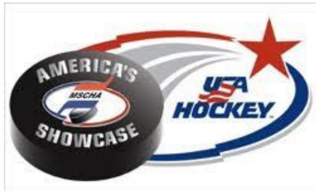
USA HOCKEY'S AMERICA'S SHOWCASE ST. LOUIS, MO APRIL 16-20, 2020 CLICK HERE FOR MORE INFO