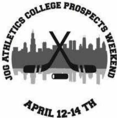
JOG ATHLETICS & BLACKHAWKS PROSPECTS CHICAGO, IL APRIL 12-14, 2020 CLICK HERE FOR MORE INFO

Here are a couple of early spring events that have reached out to us and that have had successful ACHA representation in the past that you may want to consider attending: